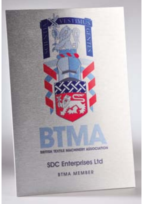
SDC Enterprises Ltd are members of the BTMA