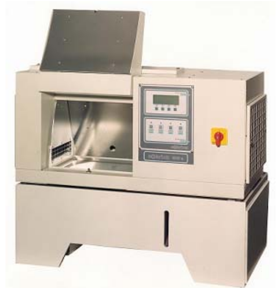
SOLARBOX 1500 E with FLOODING

PVC and corrosion-resistant materials ensure long life of this tank pump system: capacity up to 50 litres.