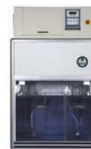
SOLARBOX R.H. with Humidity Control

We reserve the right to make changes to equipment and systems in response to advances in technology and modify parameter values accordingly.