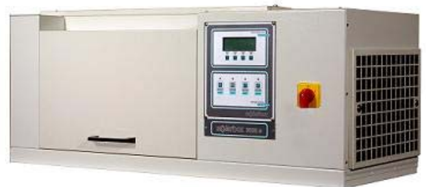
SOLARBOX 3000 E

Consequently, because the temperature produces an accelerated ageing, it is essential to be able to control of B.S.T. during exposure to filtered Xenon radiation.