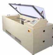
Horizontal Salt spray chambers.