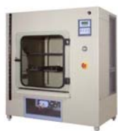
Vertical Salt spray chambers.